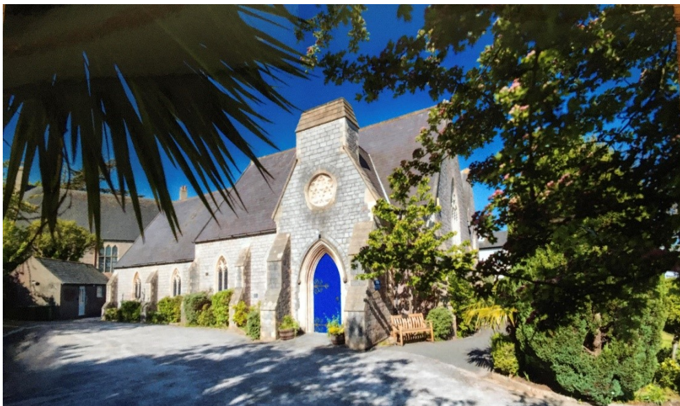
An unusual perspective of our church building