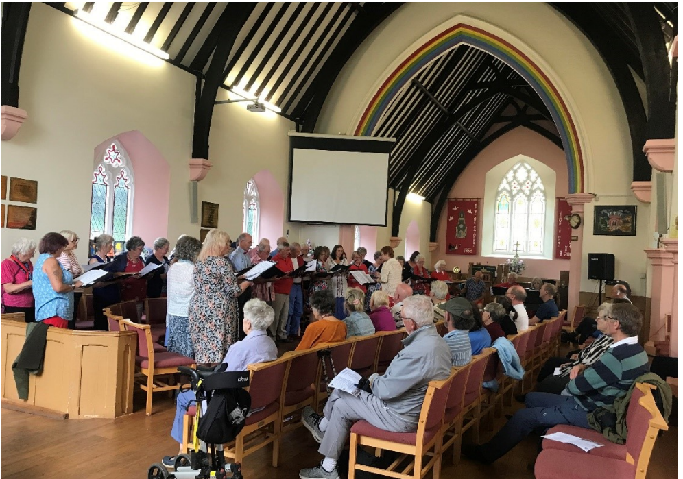
Choir 86 gave us an amazing afternoon concert last month, with the church turned sideways

THE £100 GARDEN PARTY THAT WASN'T – see pages 8/9