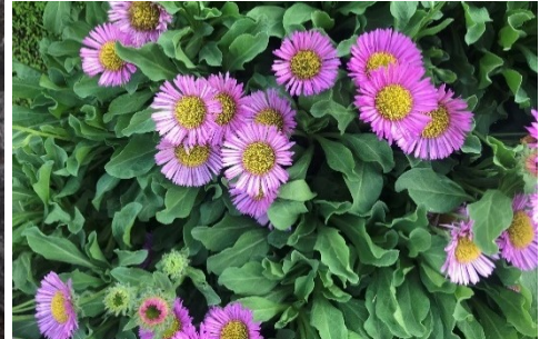
Some of the July manse garden flower pictures