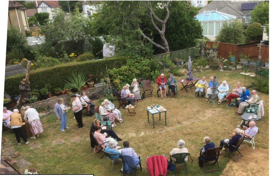
A similar view in 2022