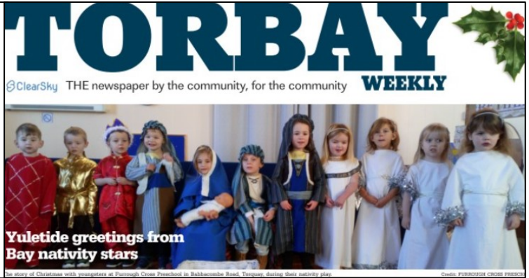
The story of Christmas with youngsters at Furrough Cross Preschool in Babbarstone Road, Torbay. Singing their nativity play.

Furrough Cross Pre-School held their nativity in the church hall, and they were featured in this lovely front page photo!